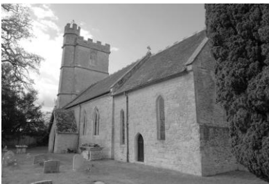
(St Nicholas, Manston)

Church Giving! Please do continue to support the work and ministry of the church. Giving to the church is about supporting the life and work of the local church. On the Okeford Benefice website, just click on the blue 'donate' button, and find the picture of your village church – there are various ways of giving money including by card, PayPal or BACS. (There is a separate tile for the reordering project at St Andrew's, and the re-roofing at Holy Rood).