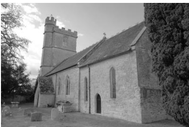
(St Nicholas, Manston)

Tuesday Morning Prayer Meeting ID: 477 411 962 Password: 078302 Wednesday Morning Prayer Meeting ID: 786 031 572 Password: 022630 Thursday Morning Prayer Meeting ID: 612 970 430 Password: 022861 Friday Morning Prayer Meeting ID: 943 031 333 Password: 078758